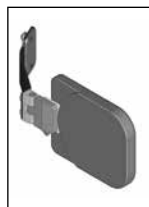
Swing-Away (Right) Lateral Trunk Support