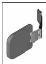
Swing-Away (Left) Lateral Trunk Support