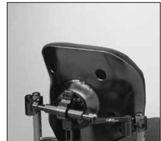
Fixed Ride FlexLoc Mount

NOTE: The Ride FlexLoc Mount can be interfaced with most any wheelchair configuration. Contact Ride Designs for a solution to your mounting challenge.