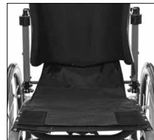
Privacy flap covers the space between the cushion and back support.