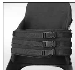
Abdominal Support Panel.