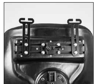
Integrated Headrest/Accessories Mount with Shoulder Harness Guides and headrest mount installed.