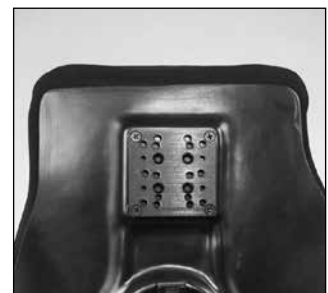
Universal Headrest Mounting Plate.