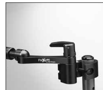
Quick Release Option