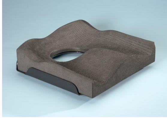
Commode cushion inserted into base pan for use.