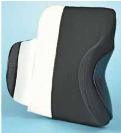
▲ Cutaway view of Ride Custom Back shell, soft foam layer, and spacer fabric cover.