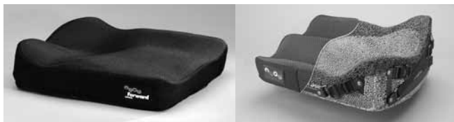
▲ The Ride Forward™ Cushion

The Ride Corbac works best when used with the Ride Forward™ or Ride Custom Cushion