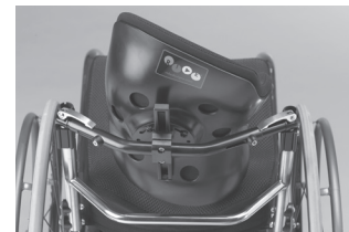
Light adjustable & removable Multi-axial Hardware.

Soft Fit Option (Half-inch thick, breathable, reticulated foam liner for a softer feel. Increases lateral support thickness by .5" and may result in compromise of postural correction.)