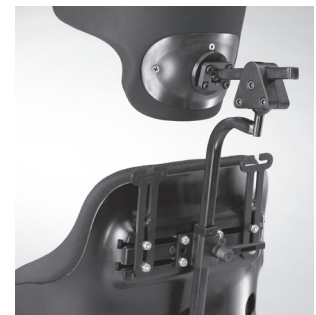
Integrated Headrest/Accessory Mount with Shoulder Harness Guides and headrest installed.