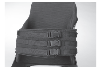
Abdominal Support Panel.