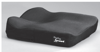
▲ The Ride Forward™ Cushion

The Ride Corbac works best when used with the Ride Forward™ or Ride Custom Cushion