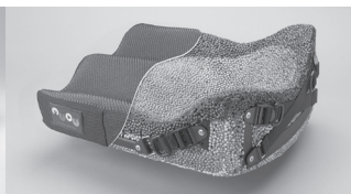
▲ The Ride Custom Cushion*

*Cut away view of spacer mesh integrated cushion cover.